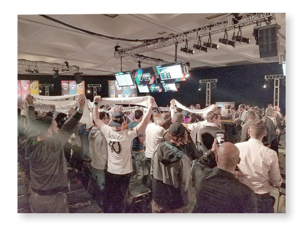
Inside the MLS SuperDraft