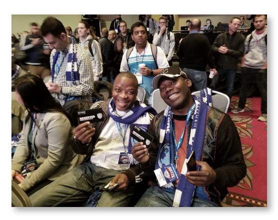
2018 Attendees @ the Draft